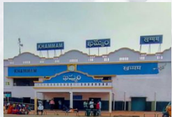
15 min - Khammam Railway station