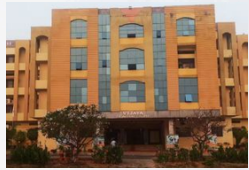
Surrounded by Engineering & Pharmacy Colleges