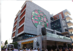
Proposed IT Hub