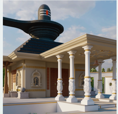
LORD SHIVA TEMPLE