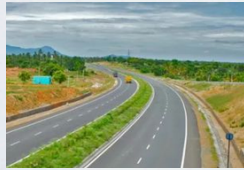
2 min - Amravati highway