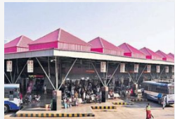
15 min - Bus Stand