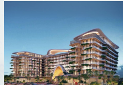
Proposed 5 star Hotel