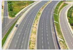
2 min - Green field highway