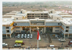
5 min - Collectorate