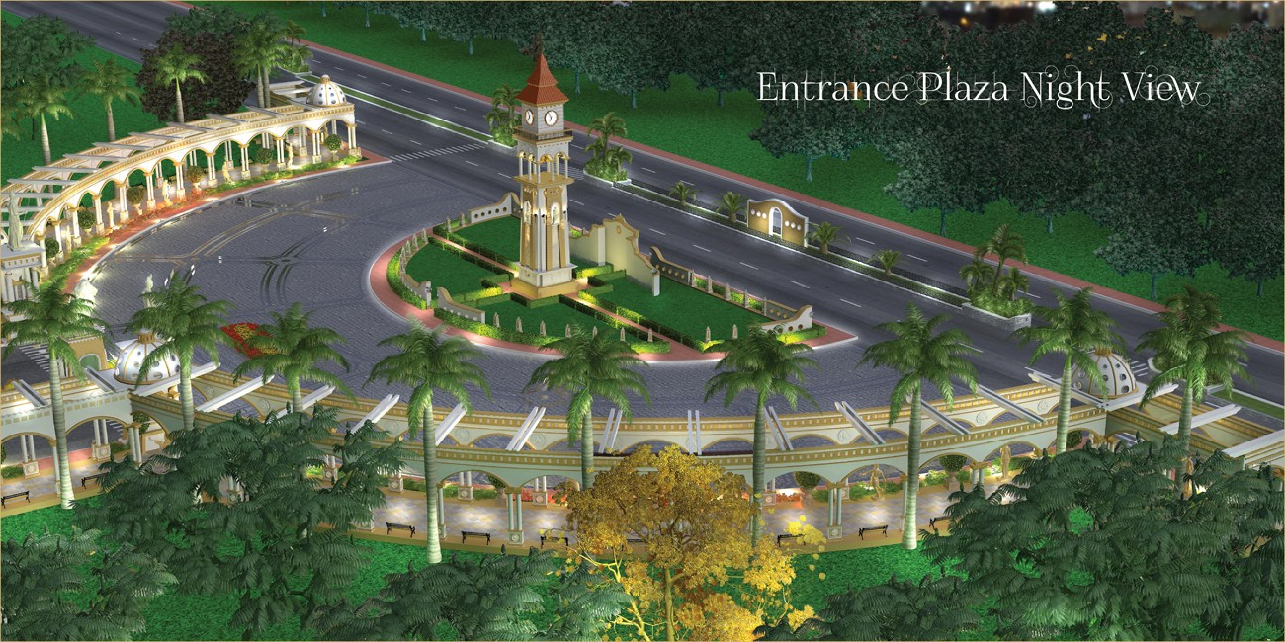
Entrance Plaza Night View